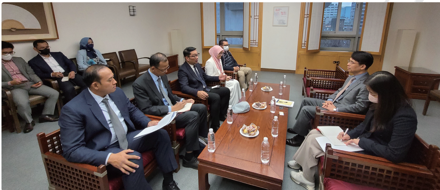
Indonesia-Republic of Korea Dialogue: 2023 FEALAC Youth Summit in Indonesia